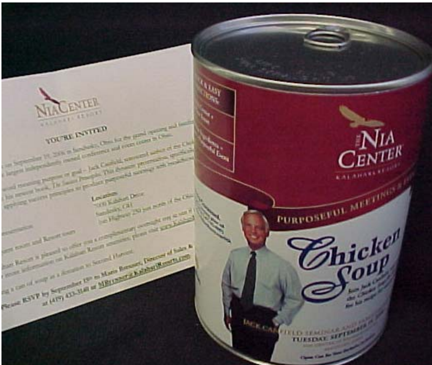
Front of Can with invitation that was inserted